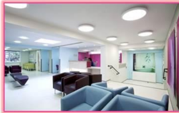
A photo of inside the Wolverton Centre

At The Wolverton Centre, Kingston Hospital NHS Foundation Trust, Galsworthy Road, Kingston, Surrey KT2 7QB.