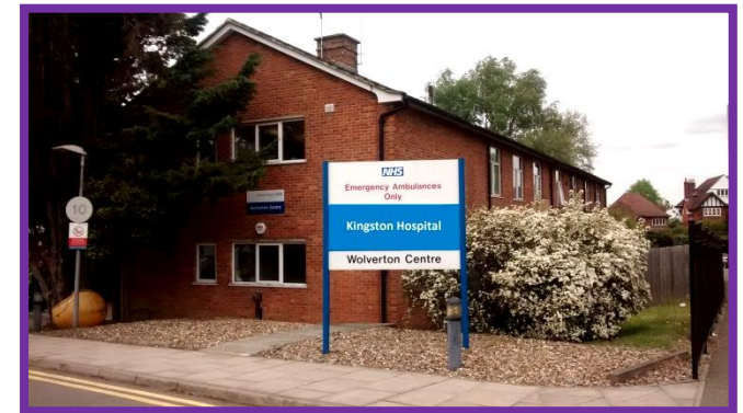
Appointments every Wednesday from 3.00pm

A sexual health service for people of all ages, with learning difficulties or Autistic Spectrum Disorder